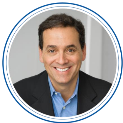
Daniel Pink Author

Desire to be connected vs increasingly disconnected workplace.